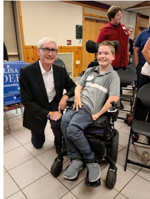
Me with Governor Evers